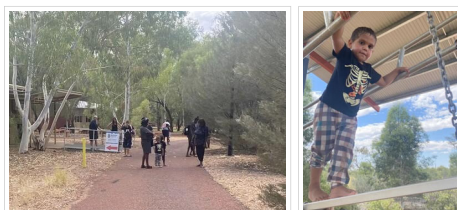
Batchelor Institute of Indigenous Tertiary Education Visit